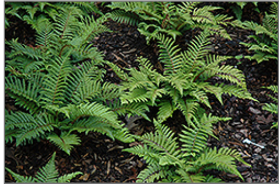
Japanese Tassel Fern

Japanese Tassel Fern is recommended for the following landscape applications;