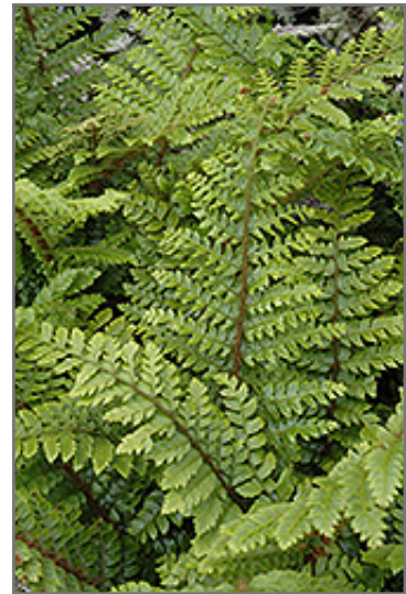
Japanese Tassel Fern foliage