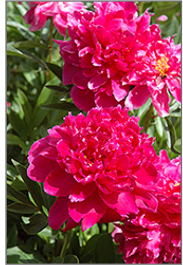
Shawnee Chief Peony flowers