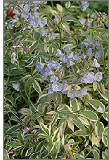
Touch Of Class Jacob's Ladder flowers

Touch Of Class Jacob's Ladder is recommended for the following landscape applications;