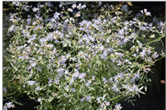
Touch Of Class Jacob's Ladder flowers