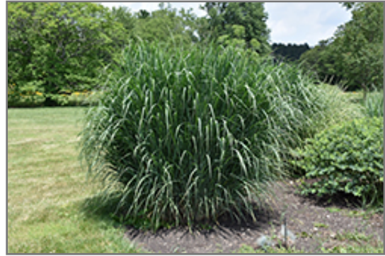
Dewey Blue Switch Grass