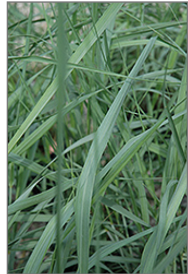
Dewey Blue Switch Grass foliage