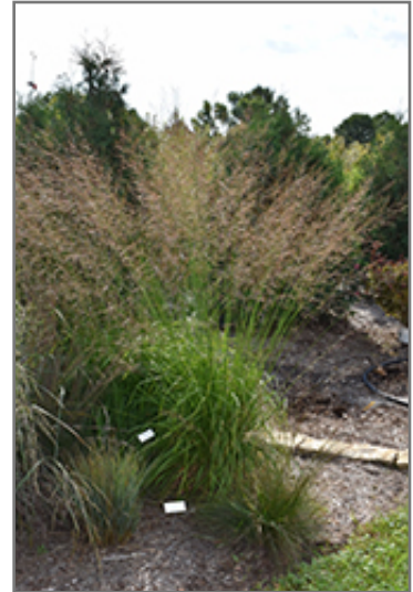
Skyracer Moor Grass