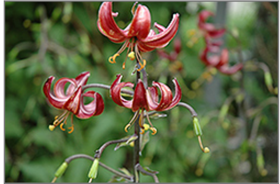
Claude Shride Martagon Lily flowers