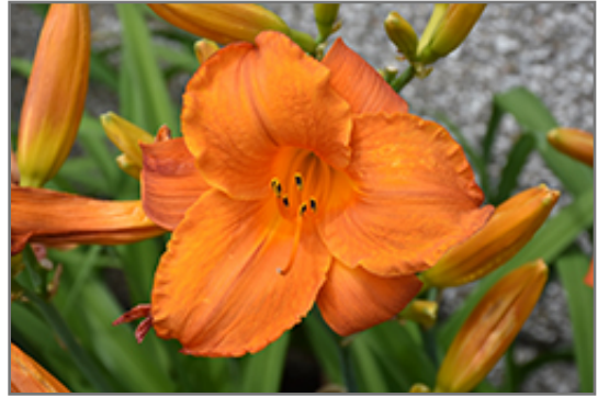
Mauna Loa Daylily flowers