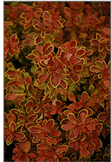
Admiration Japanese Barberry foliage

Admiration Japanese Barberry is recommended for the following landscape applications;