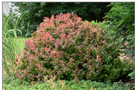
Admiration Japanese Barberry