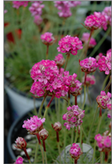
Splendens Sea Thrift flowers