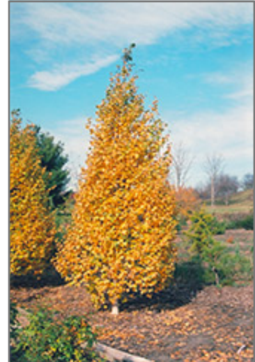
Whitespire Birch in fall