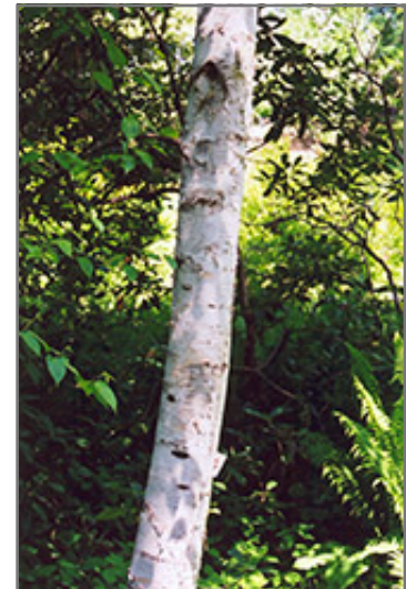
Whitespire Birch bark