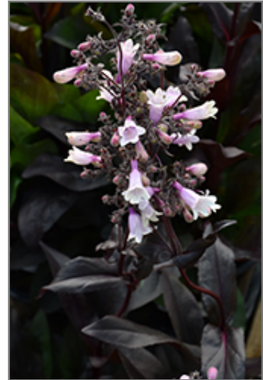
Dark Towers Beard Tongue flowers