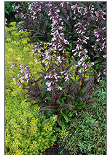
Dark Towers Beard Tongue in bloom