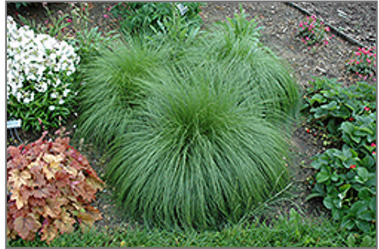
Prairie Dropseed

Prairie Dropseed is recommended for the following landscape applications;