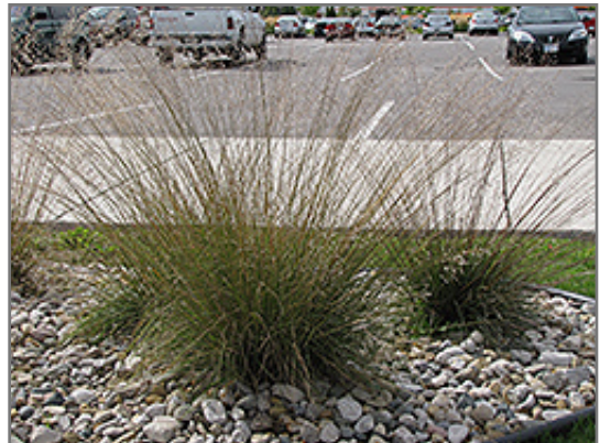
Prairie Dropseed