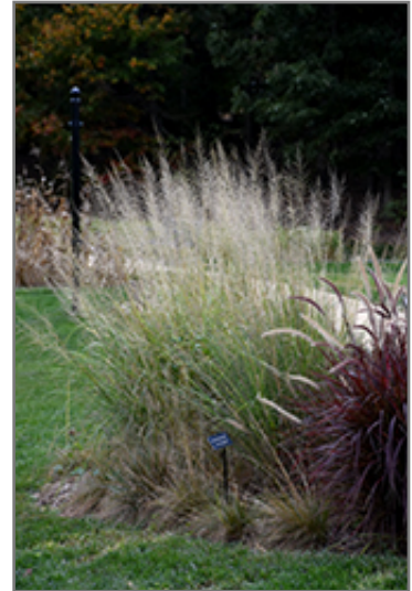
Prairie Dropseed fruit

This plant does best in full sun to partial shade. It is very adaptable to both dry and moist locations, and should do just fine under typical garden conditions. It is considered to be drought-tolerant, and thus makes an ideal choice for a low-water garden or xeriscape application. It is not particular as to soil type or pH, and is able to handle environmental salt. It is somewhat tolerant of urban pollution. This species is native to parts of North America.