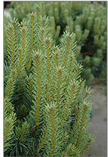
Dwarf Scotch Pine foliage