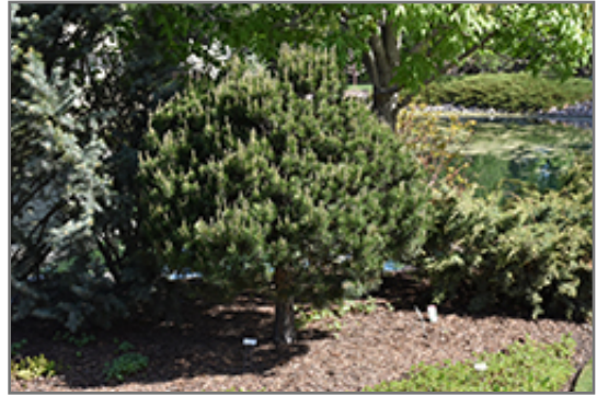
Dwarf Scotch Pine