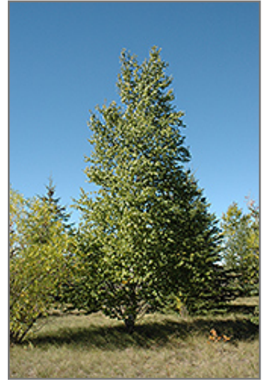
Paper Birch

This tree does best in full sun to partial shade. It prefers to grow in average to moist conditions, and shouldn't be allowed to dry out. It is not particular as to soil type or pH. It is somewhat tolerant of urban pollution. Consider applying a thick mulch around the root zone in winter to protect it in exposed locations or colder microclimates. This species is native to parts of North America.