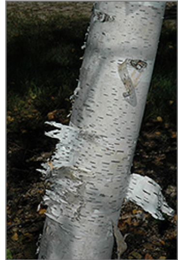
Paper Birch bark

Paper Birch is recommended for the following landscape applications;