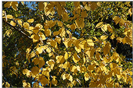
Paper Birch in fall