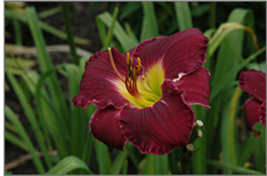
Bela Lugosi Daylily flowers