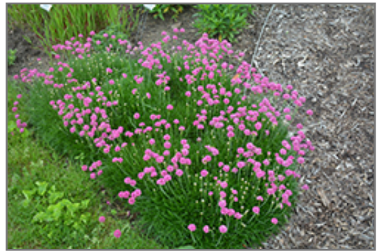
Bloodstone Sea Thrift in bloom