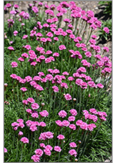
Bloodstone Sea Thrift in bloom

Bloodstone Sea Thrift is recommended for the following landscape applications;