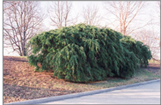
Sargent's Weeping Hemlock

Sargent's Weeping Hemlock is recommended for the following landscape applications;