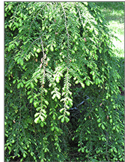
Sargent's Weeping Hemlock foliage