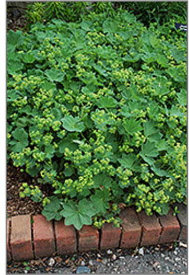
Thriller Lady's Mantle in bloom