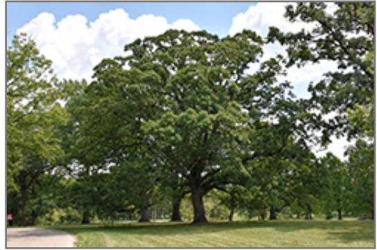
White Oak