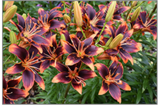
Forever Susan Lily flowers