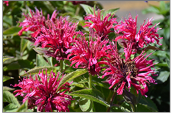
Pardon My Cerise Beebalm flowers