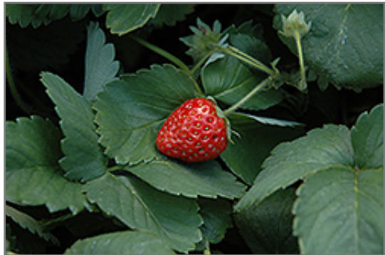
Fort Laramie Strawberry fruit

Fort Laramie Strawberry features dainty white daisy flowers with yellow eyes along the stems from late spring to mid summer. Its tomentose round compound leaves remain green in color throughout the season. It features an abundance of magnificent scarlet berries from early to late summer.