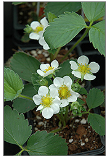
Fort Laramie Strawberry flowers