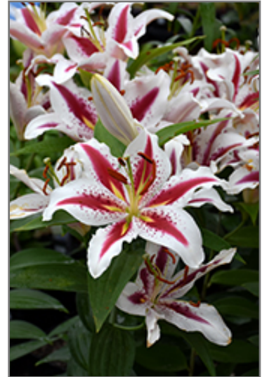
Big Smile Lily flowers

Eye-catching tricolored blooms make an excellent addition to landscapes, garden beds and borders; outward facing, white blooms with deep red flames and yellow star shaped centers rise above narrow green foliage; summer blooming