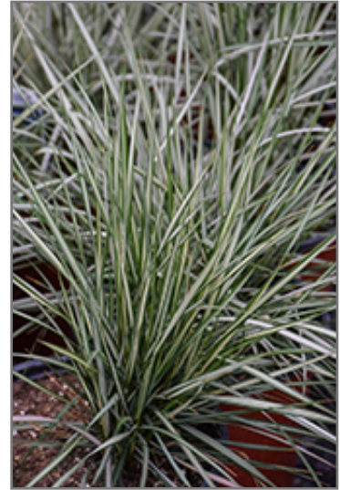
Lightning Strike Variegated Reed Grass foliage

Dramatic purple-pink plumes rising above creamy white foliage with green margins make an appearance in the early summer months; looks wonderful in fresh or dried flower arrangements, borders, or garden landscapes; drought tolerant once established