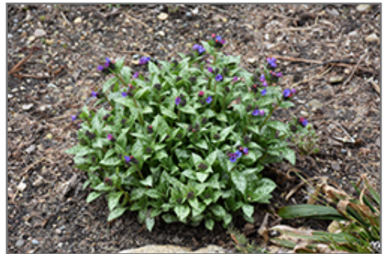
Spot On Lungwort in bloom