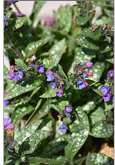
Spot On Lungwort flowers

Spot On Lungwort is recommended for the following landscape applications;