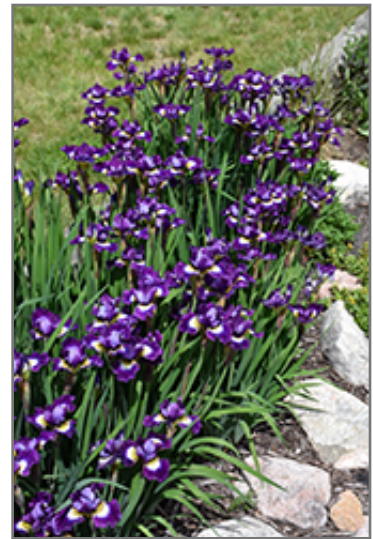
Jewelled Crown Siberian Iris in bloom