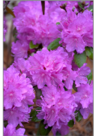
Black Hat Rhododendron flowers

Black Hat Rhododendron will grow to be about 3 feet tall at maturity, with a spread of 3 feet. It tends to be a little leggy, with a typical clearance of 1 foot from the ground. It grows at a slow rate, and under ideal conditions can be expected to live for 40 years or more.