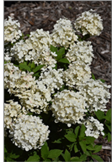
Tiny Quick Fire Hydrangea flowers