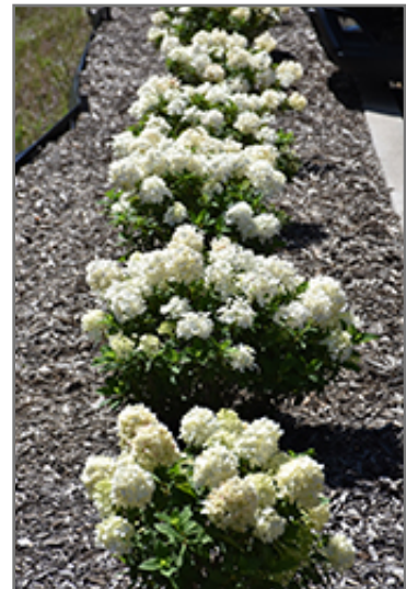
Tiny Quick Fire Hydrangea in bloom