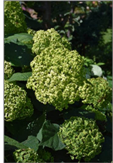
Invincibelle Sublime Smooth Hydrangea flowers

Invincibelle Sublime Smooth Hydrangea is recommended for the following landscape applications;