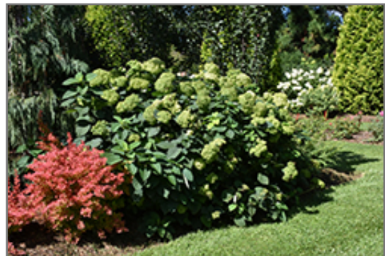
Invincibelle Sublime Smooth Hydrangea in bloom