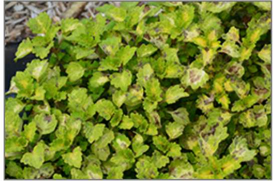
Great Falls Yosemite Coleus foliage