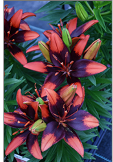
Lily Looks Tiny Ink Lily flowers