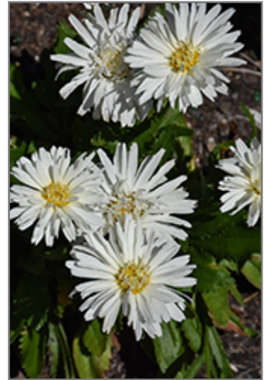
Mt. Hood Shasta Daisy flowers