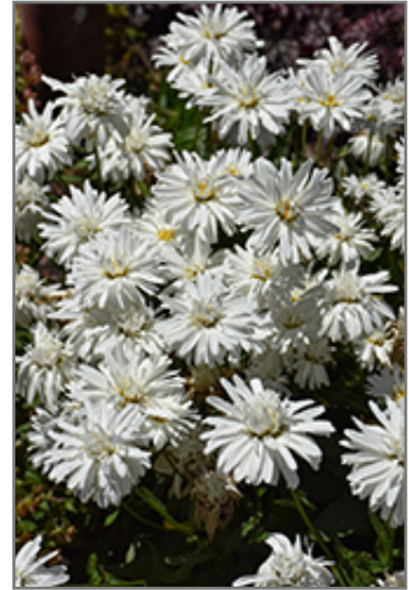
Mt. Hood Shasta Daisy flowers

Mt. Hood Shasta Daisy is recommended for the following landscape applications;