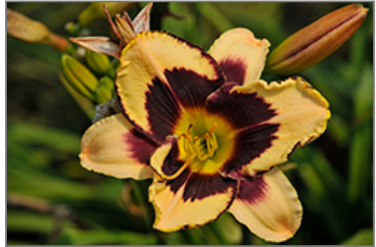
Inkheart Daylily flowers