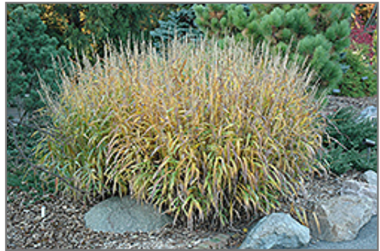
Frost Grass in fall