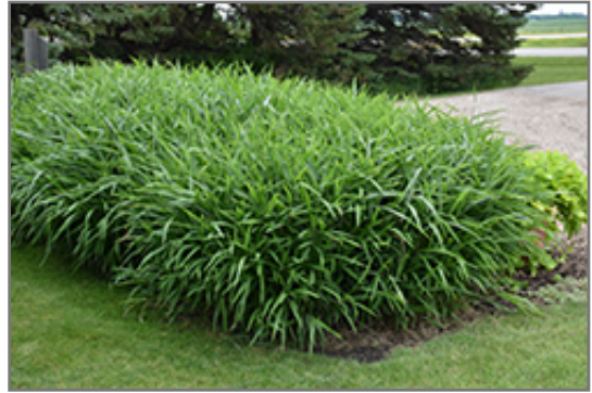
Frost Grass