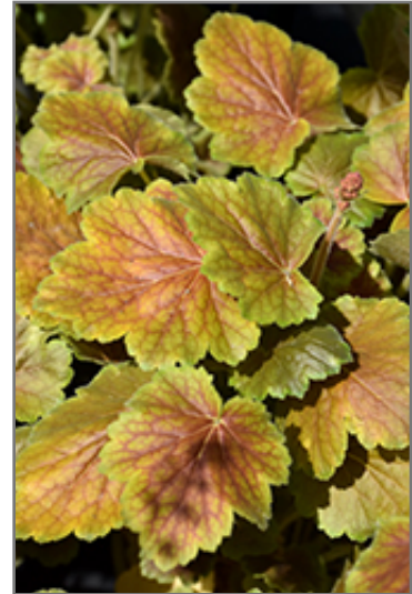
Northern Exposure Sienna Coral Bells foliage

This showy garden plant produces crisp, bright green leaves in spring, blending to sienna orange in summer; forms a dense, medium size mound; great rust resistance and longevity; excellent for defining border edges with bright, contrasting color