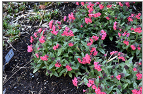
Shrimps On The Barbie Lungwort in bloom