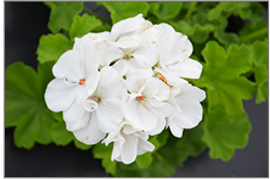
Calliope Medium White Geranium flowers