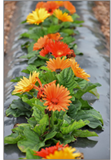
Jaguar Fire Gerbera Daisy in bloom

Jaguar Fire Gerbera Daisy is recommended for the following landscape applications;