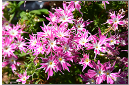
Popstars Pink Phlox flowers