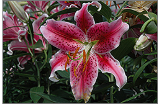
Stargazer Lily flowers