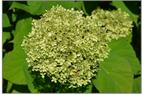
Lime Rickey Smooth Hydrangea flowers (faded)

This shrub does best in full sun to partial shade. You may want to keep it away from hot, dry locations that receive direct afternoon sun or which get reflected sunlight, such as against the south side of a white wall. It prefers to grow in average to moist conditions, and shouldn't be allowed to dry out. It is not particular as to soil type or pH. It is highly tolerant of urban pollution and will even thrive in inner city environments. Consider applying a thick mulch around the root zone in winter to protect it in exposed locations or colder microclimates. This is a selection of a native North American species.