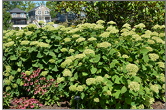
Lime Rickey Smooth Hydrangea in bloom