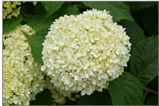
Lime Rickey Smooth Hydrangea flowers