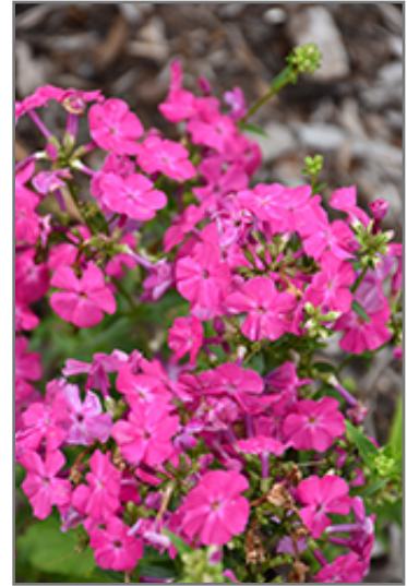
Kung Fuchsia Garden Phlox flowers

A stunning hybrid producing masses of intense, bright fuchsia flowers that cover the plant; compact, long blooming, and carefree; suitable for containers or small perennial borders; great mildew resistance; cut back faded flowers to encourage re-blooming