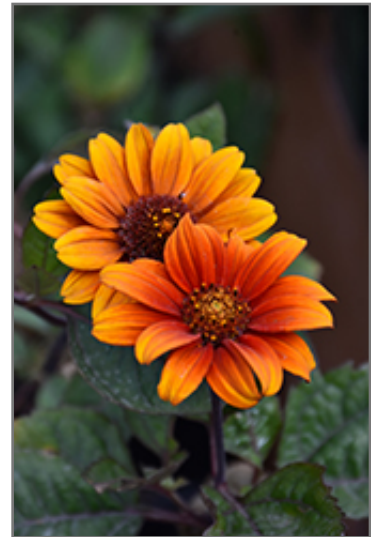
Bleeding Hearts False Sunflower flowers