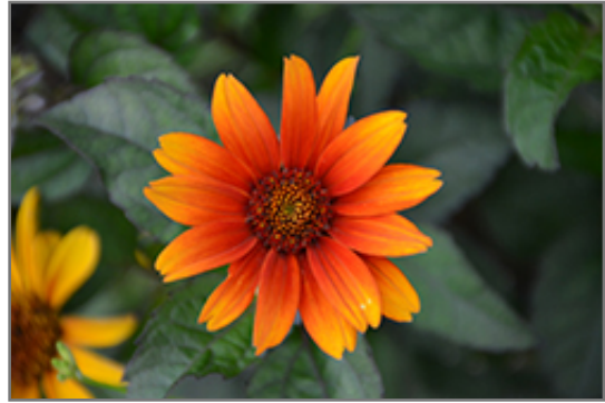
Bleeding Hearts False Sunflower flowers

Bleeding Hearts False Sunflower is an herbaceous perennial with an upright spreading habit of growth. Its medium texture blends into the garden, but can always be balanced by a couple of finer or coarser plants for an effective composition.