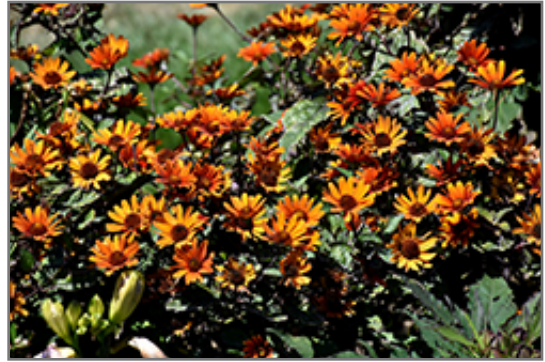
Bleeding Hearts False Sunflower flowers

This plant does best in full sun to partial shade. It is very adaptable to both dry and moist locations, and should do just fine under typical garden conditions. It is not particular as to soil type or pH, and is able to handle environmental salt. It is highly tolerant of urban pollution and will even thrive in inner city environments. This is a selection of a native North American species. It can be propagated by division; however, as a cultivated variety, be aware that it may be subject to certain restrictions or prohibitions on propagation.