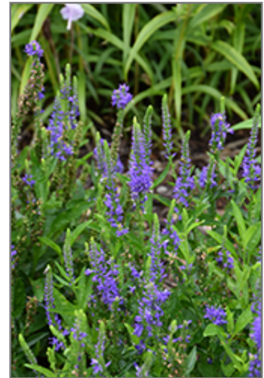
Royal Rembrandt Speedwell flowers