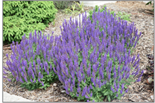
Royal Rembrandt Speedwell in bloom

Royal Rembrandt Speedwell is recommended for the following landscape applications;