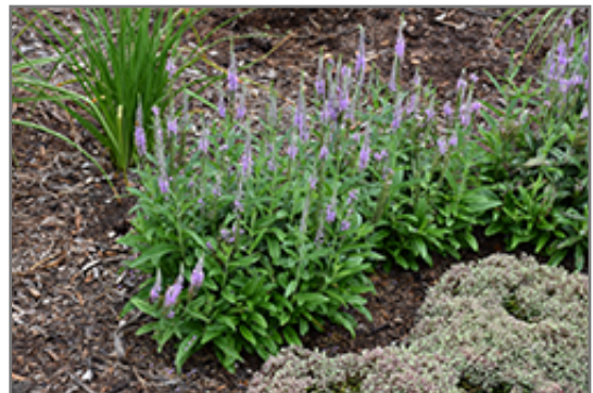
Lavender Lightsaber Speedwell in bloom