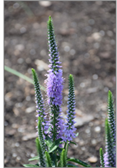
Lavender Lightsaber Speedwell flowers

Lavender Lightsaber Speedwell is recommended for the following landscape applications;