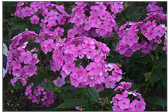
Cloudburst Phlox flowers