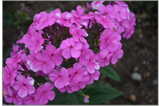
Cloudburst Phlox flowers

Cloudburst Phlox is recommended for the following landscape applications;