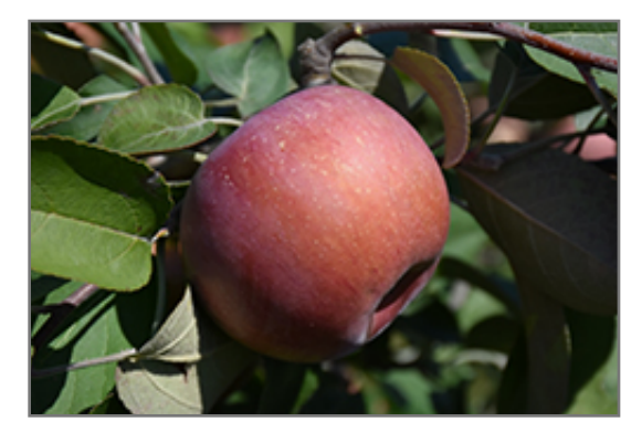
SnowSweet Apple fruit