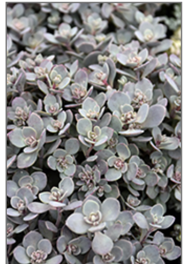
SunSparkler Blue Elf Sedoro foliage