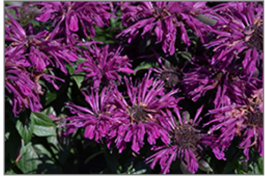
Rockin' Raspberry Beebalm flowers