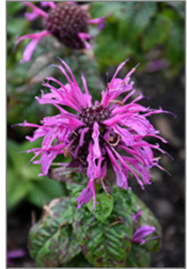
Leading Lady Plum Beebalm flowers

This variety forms a dense, compact mound of magenta-purple flowers, on well branched, strong stems, over lush dark green foliage that has an excellent resistance to powdery mildew; great for massing along border fronts